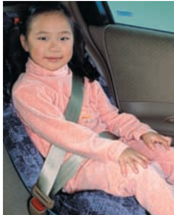
National Highway Traffic Safety Administration

To find an authorized safety technician near you, visit www.nhtsa.dot.gov/people/injury/childps or call 888-DASH-2-DOT (888.327.4236).